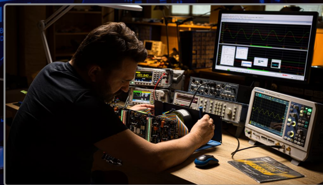
Calibration procedure in HUM Audio Devices Lab

All these settings are on rotary switches, as you expect from mastering equipment. Left and Right channels detection circuits are stereo linkable. You can also use LAAL as two independent mono limiters if you wish.