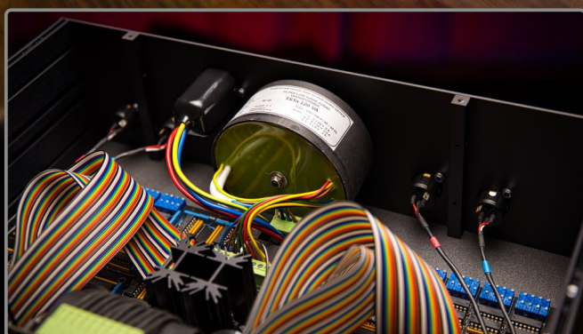
Power module with custom built transformer

To reach this extreme quality - we designed our own discrete opamps and used the best possible transistors, polystyrene capacitors, military spec resistors, top audio transformers and gold plated rotary and relay switches.